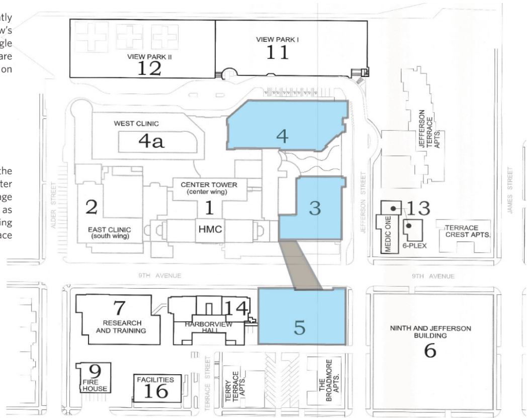
Inpatient beds on campus

Other critical hospital - departments such as the pharmacy and laboratory are located in the Center Tower (1). While the Center Tower square footage total's 202,000 SF, only 99,000 SF serves as primary functions of the hospital. The remaining 103,000 SF is utilized as office and storage space for the campus.